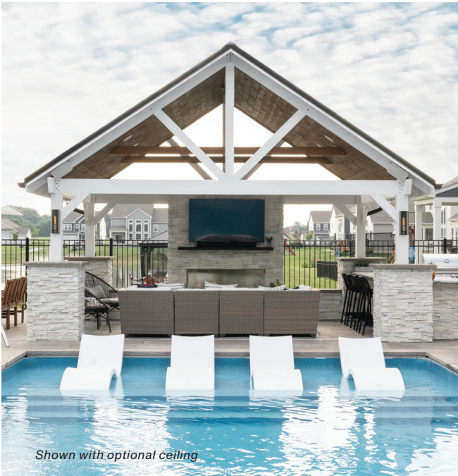
Shown with optional ceiling

With its open gable trusses, this pavilion maximizes the benefits of being outdoors while keeping you under shelter.